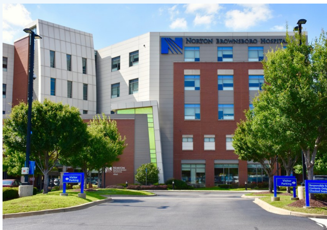
Norton Brownsboro Hospital 4960 Norton Healthcare Boulevard Louisville, KY 40241

Two days of information is presented in a relaxed, professional atmosphere, delivered with humor and real life events that help you to relate the recommended practices to your own perianesthesia nursing practice. You will retain the information for the exam and for years to come.