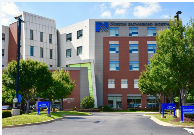
Norton Brownsboro Hospital 4960 Norton Healthcare Boulevard Louisville, KY 40241

You will learn during class how to focus your study and improve your areas of opportunity. I recommend you schedule your exam the month following The CNOR Prep and Review Course.