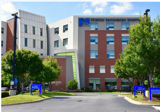
Norton Brownsboro Hospital 4960 Norton Healthcare Boulevard Louisville, KY 40241

Two days of information is presented in a relaxed, professional atmosphere, delivered with humor and real life events that help you to relate the recommended practices to your own perianesthesia nursing practice. You will retain the information for the exam and for years to come.