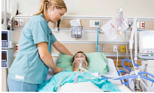
Professional Development for Perianesthesia Nurses

April 23-24, 2025 16.25 contact hours provided