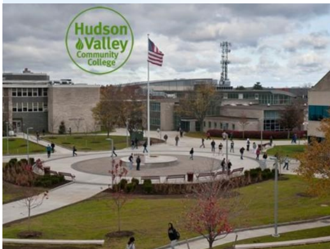
Hudson Valley Community College Main Campus 80 Vandenburg Avenue Troy NY 12180

The hand outs and practice tests will be mailed to the address you enter into the PayPal site and should arrive within a week of registration.