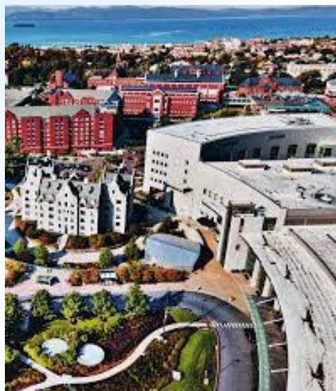
University of Vermont Medical Center 111 Colchester Ave Burlington, Vermont

You will learn during class how to focus your study and improve your areas of opportunity. I recommend you schedule your exam the month following The CNOR Prep and Review Course.