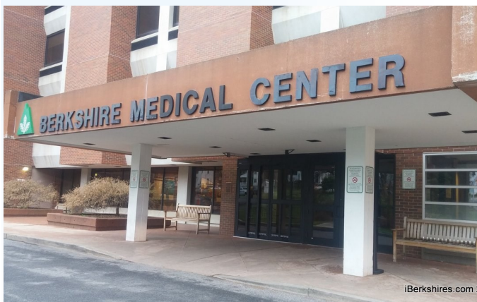
Berkshire Medical Center 742 North St, Pittsfield, Massachusetts

Two days of information is presented in a relaxed, professional atmosphere, delivered with humor and real life events that help you to relate the recommended practices to your own perianesthesia nursing practice. You will retain the information for the exam and for years to come.