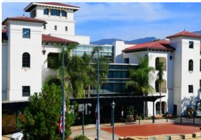
Santa Barbara Cottage Hospital 400 W. Pueblo St. Santa Barbara, CA 93101

You will learn during class how to focus your study and improve your areas of opportunity. I recommend you schedule your exam the month following The CNOR Prep and Review Course.