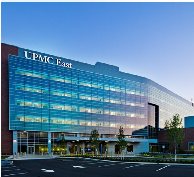
UPMC East 2700 Mossydale Blvd Monroeville PA 15146

You will learn during class how to focus your study and improve your areas of opportunity. I recommend you schedule your exam the month following The CNOR Prep and Review Course.