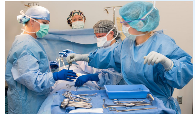
Professional Development for Perianesthesia Nurses