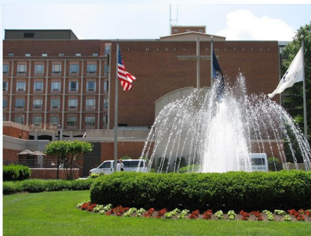
Bon Secours St. Mary's Hospital 5801 Bremono Rd, Richmond, VA 23226

You will learn during class how to focus your study and improve your areas of opportunity. I recommend you schedule your exam the month following The CNOR Prep and Review Course.