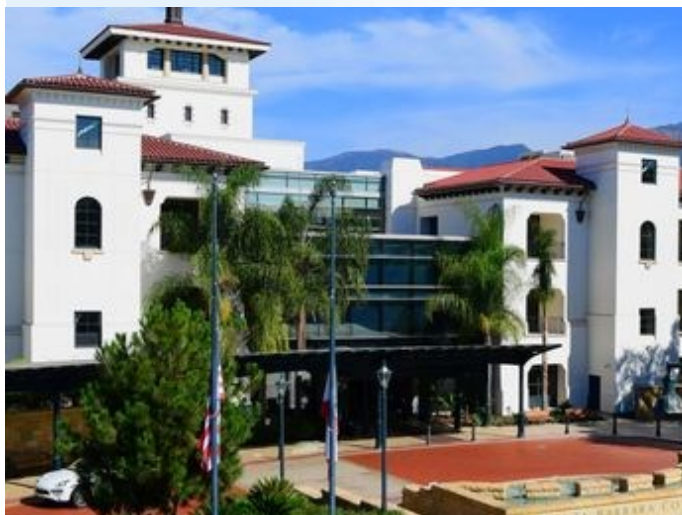
Santa Barbara Cottage Hospital 400 W. Pueblo St. Santa Barbara, CA 93101

The hand outs and practice tests will be mailed to the address you enter into the PayPal site and should arrive within a week of registration.