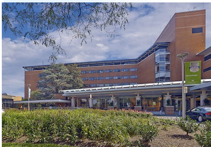
Lankenau Medical Center 100 E Lancaster Ave, Wynnwood, PA 19096

You will learn during class how to focus your study and improve your areas of opportunity. I recommend you schedule your exam the month following The CNOR Prep and Review Course.