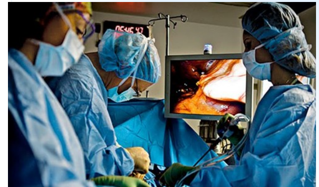
Professional Development for Perianesthesia Nurses

Baptist Health Private Dining Room (PDR) June 17, 2023