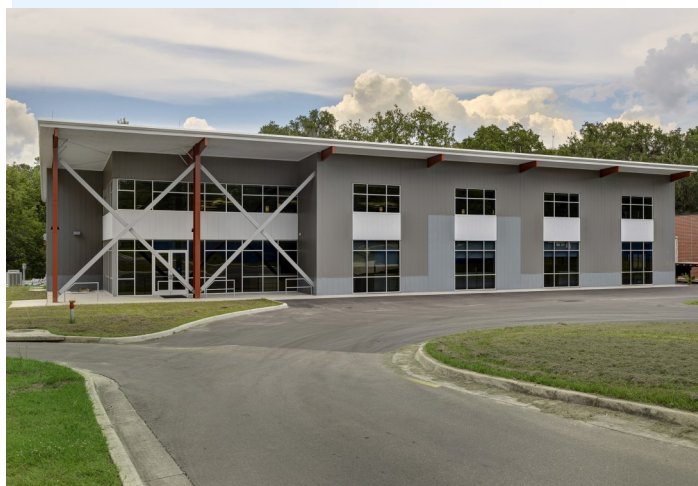
Facilities Building 1281 Newell Drive Gainesville Florida 32608

You will learn during class how to focus your study and improve your areas of opportunity. I recommend you schedule your exam the month following The CNOR Prep and Review Course.