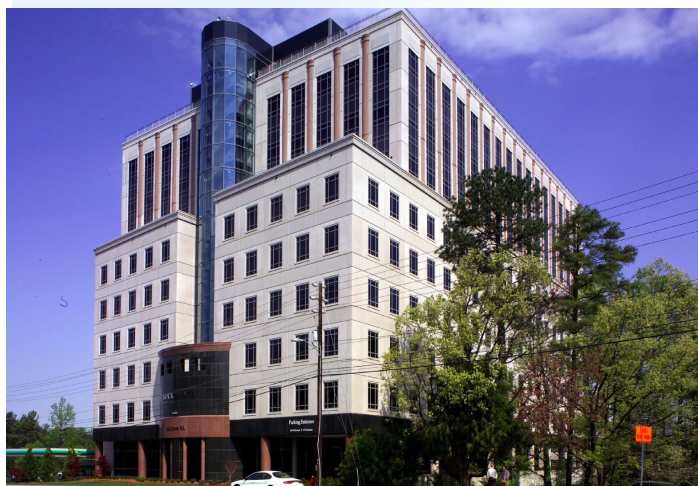
Hock Plaza Auditorium Ground level of Hock Plaza 2424 Erwin Rd. Durham, NC 27705

You will learn during class how to focus your study and improve your areas of opportunity. I recommend you schedule your exam the month following The CNOR Prep and Review Course.