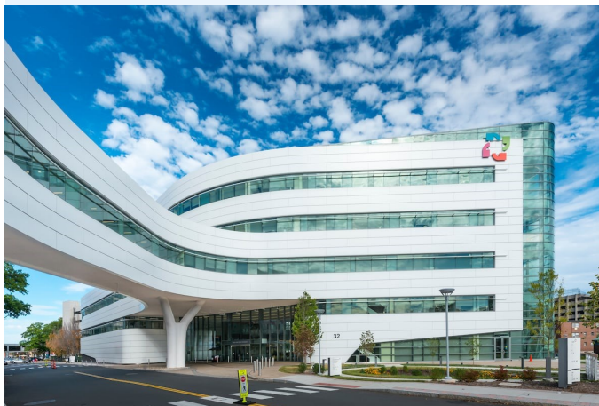
Bone & Joint Institute Ambulatory Building 31 Seymour Street Hartford, CT 06106 Auditorium

You will learn during class how to focus your study and improve your areas of opportunity. I recommend you schedule your exam the month following The CNOR Prep and Review Course.