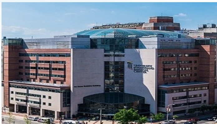
University of Maryland Medical Center 22 S Greene St Baltimore, MD. 21201

This two day course is designed to prepare perianesthesia nurses to take the Peranesthesia exams and to demonstrate clinical competence and knowledge of practice standards. After class, you will receive 16.0 contact hours and access to a recording of class available for a limited time. This is the most thorough review of perianesthesia nursing available. This is a straight forward approach to the specific information you will need to successfully complete the Certified Post Anesthesia Nurse or Certified Ambulatory PeriAnesthesia nurse exams. This course is based on ASPAN Standards and has been approved for 16.25 continuing education hours. Two days of information is presented in a relaxed, professional atmosphere, delivered with humor and real life events that help you to relate the Recommended Practices to your own perianesthesia nursing practice. You will retain the information for the exam and for years to come.