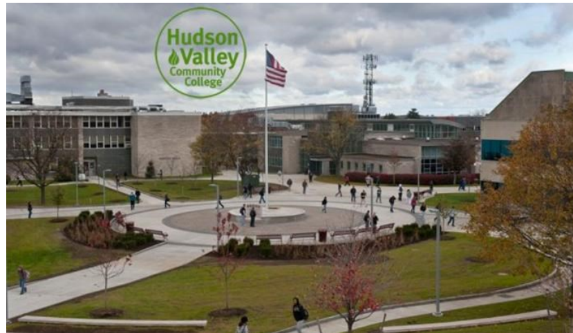
Hudson Valley Community College Main Campus 80 Vanderburgh Avenue Troy NY 12180

This is an interactive course. You will complete five modules and take five practice tests during the one day course. All required hand outs will be provided during class. It is not required for class but I recommend access to a good text book to aid your study. You will learn during class how to focus your study and improve your areas of opportunity. I recommend you schedule your exam the month following The CST Prep and Review Course.