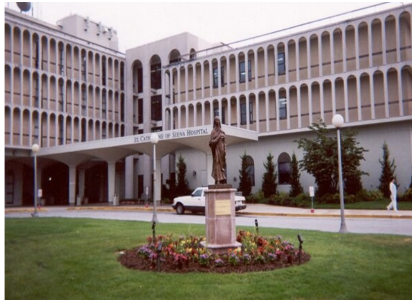
St. Catherine of Siena Hospital 50 NY-25A, Smithtown, NY 11787

You will learn during class how to focus your study and improve your areas of opportunity. I recommend you schedule your exam the month following The CNOR Prep and Review Course.