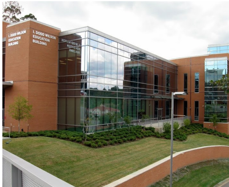
I. Dodd Wilson Education Building 116 Hooper Dr, Little Rock, AR 72205

You will learn during class how to focus your study and improve your areas of opportunity. I recommend you schedule your exam the month following The CNOR Prep and Review Course.