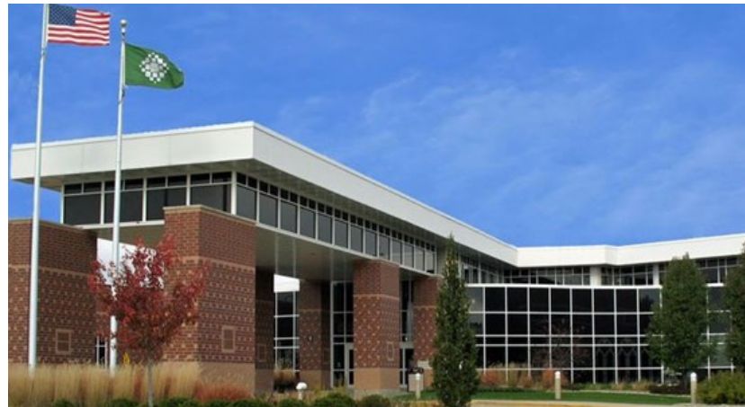
Parkview Huntington Hospital 2001 Stults Rd, Huntington, IN 46750

You will learn during class how to focus your study and improve your areas of opportunity. I recommend you schedule your exam the month following The CNOR Prep and Review Course.