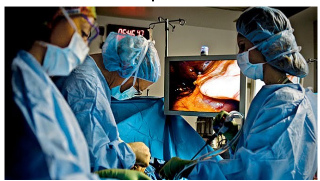
Professional Development for Perioperative Nurses

Stillwater Medical Center West Conference Room October 29-30, 2022 16.0 contact hours provided