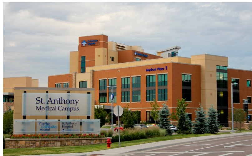
St. Anthony Hospital 11600 W 2nd Pl Lakewood, CO, 80228

You will learn during class how to focus your study and improve your areas of opportunity. I recommend you schedule your exam the month following The CNOR Prep and Review Course.