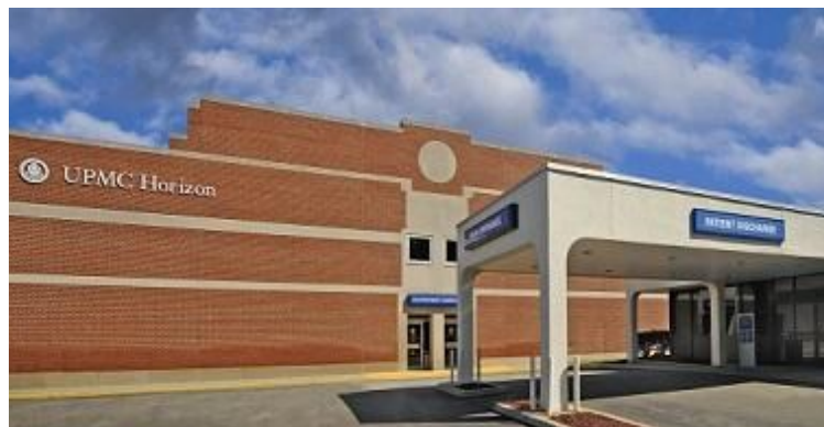
UPMC Horizon Greenville campus 110 North Main Street, Greenville, PA 16125

You will learn during class how to focus your study and improve your areas of opportunity. I recommend you schedule your exam the month following The CNOR Prep and Review Course.