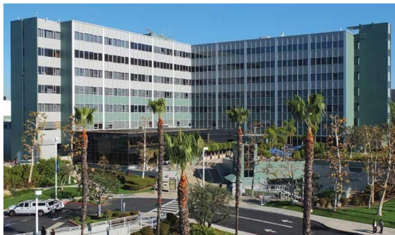
Long Beach Memorial Medical Center Boardroom 2801 Atlantic Ave . Long Beach, CA 90806

You will learn during class how to focus your study and improve your areas of opportunity. I recommend you schedule your exam the month following The CNOR Prep and Review Course.