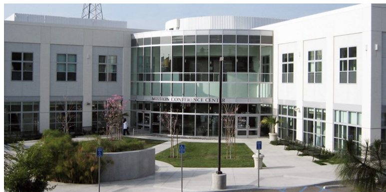
Mission Conference Center 26726 Crown Valley Parkway, Mission Viejo, CA 92691

Two days of information is presented in a relaxed, professional atmosphere, delivered with humor and real life events that help you to relate the Recommended Practices to your own perianesthesia nursing practice. You will retain the information for the exam and for years to come.