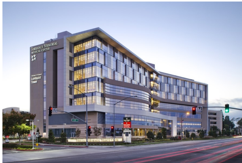
Torrance Memorial Medical Center 3330 Lomita Drive, Torrance, CA, 90505

Two days of information is presented in a relaxed, professional atmosphere, delivered with humor and real life events that help you to relate the Recommended Practices to your own perianesthesia nursing practice. You will retain the information for the exam and for years to come.