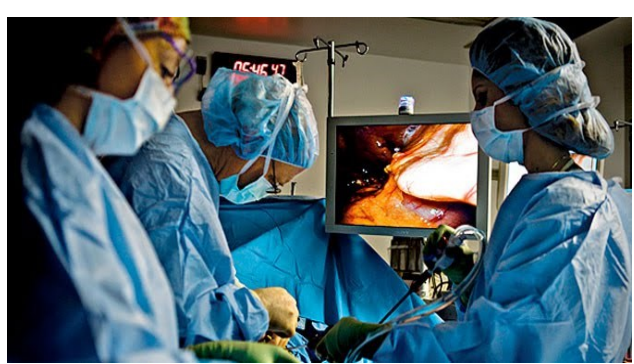
Professional Development for Perioperative Nurses

Virtual Classroom January 9-10, 2021 16.0 Contact Hours Provided