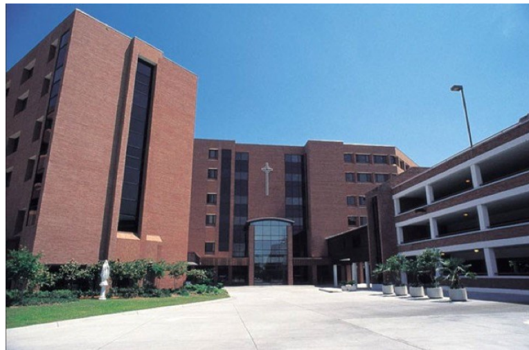
Our Lady of the Lake Regional Medical Center 5000 Hennessy Blvd Baton Rouge, La 70808

Two days of information is presented in a relaxed, professional atmosphere, delivered with humor and real life events that help you to relate the Recommended Practices to your own perianesthesia nursing practice. You will retain the information for the exam and for years to come.