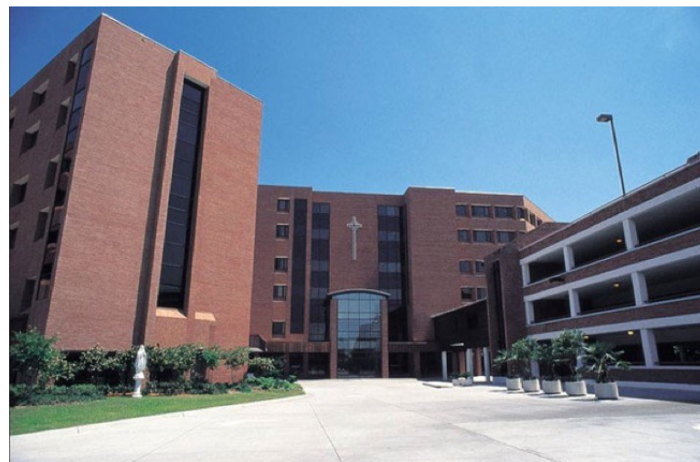
Our Lady of the Lake Regional Medical Center 5000 Hennessey Blvd Baton Rouge, La 70808

Two days of information is presented in a relaxed, professional atmosphere, delivered with humor and real life events that help you to relate the Recommended Practices to your own perianesthesia nursing practice. You will retain the information for the exam and for years to come.