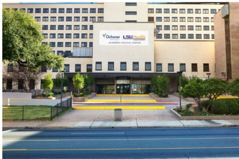
University Med School building Ground floor of the med school Rm.G-221 1501 Kings Hwy, Shreveport, LA 71103

This is an interactive course. You will complete five modules and take five practice tests during the one day course. All required hand outs will be provided during class. It is not required for class but I recommend access to a good text book to aid your study. You will learn during class how to focus your study and improve your areas of opportunity. I recommend you schedule your exam the month following The CST Prep and Review Course.