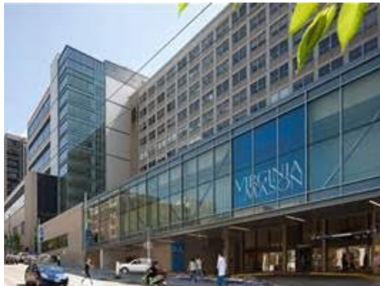
Lindeman Pavilion 1201 Terry Ave. Seattle, WA 98101

This two day course is designed to prepare perianesthesia nurses to take the Peranesthesia exams and to demonstrate clinical competence and knowledge of practice standards. After class, you will receive 16.0 contact hours and access to a recording of class available for a limited time. This is the most thorough review of perianesthesia nursing available. This is a straight forward approach to the specific information you will need to successfully complete the Certified Post Anesthesia Nurse or Certified Ambulatory PeriAnesthesia nurse exams. This course is based on ASPAN Standards and has been approved for 16.0 continuing education hours. Two days of information is presented in a relaxed, professional atmosphere, delivered with humor and real life events that help you to relate the Recommended Practices to your own perianesthesia nursing practice. You will retain the information for the exam and for years to come.