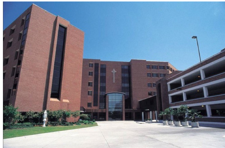
Our Lady of the Lake Regional Medical Center 5000 Hennessey Blvd Baton Rouge, La 70808

Two days of information is presented in a relaxed, professional atmosphere, delivered with humor and real life events that help you to relate the Recommended Practices to your own perianesthesia nursing practice. You will retain the information for the exam and for years to come.